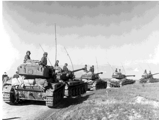
Evacuation of Israeli forces from the Gaza Strip, 7 March 1957.

The political campaign began with the convening of the Security Council almost immediately after the fighting began on 29 October 1956 and ended with the Israeli withdrawal from Gaza and Sharm el-Sheikh in March 1957 and its aftermath. Israel's aims changed gradually over these five months, focusing on the protection of its navigation rights in the Gulf of Aqaba and prevention of the restoration of Egyptian rule in the Gaza Strip. Though the results of the political campaign were not as clear cut and unambiguous as those of the battles, they proved, in the long run, to be more enduring and solid.